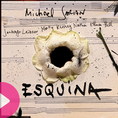
ESQUINA ( Greenleaf Music, 2025 ).